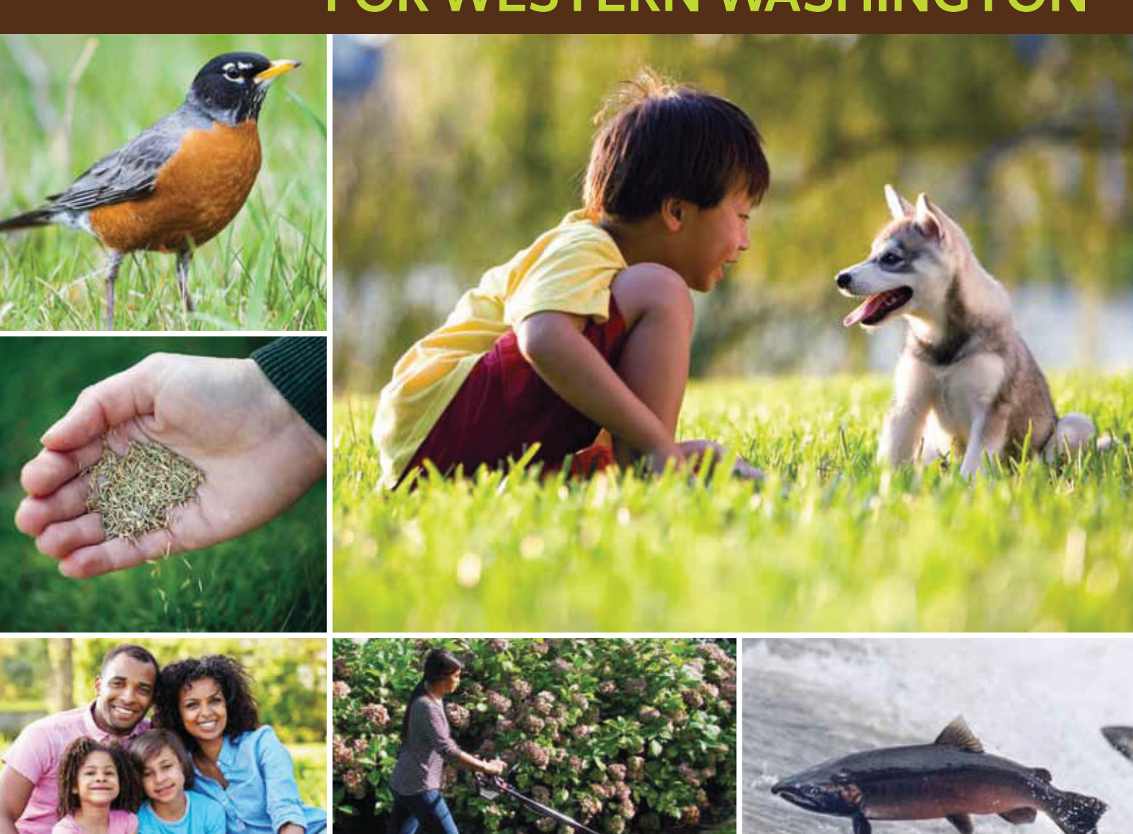
Easy practices for healthy lawns, healthy families and a healthy environment